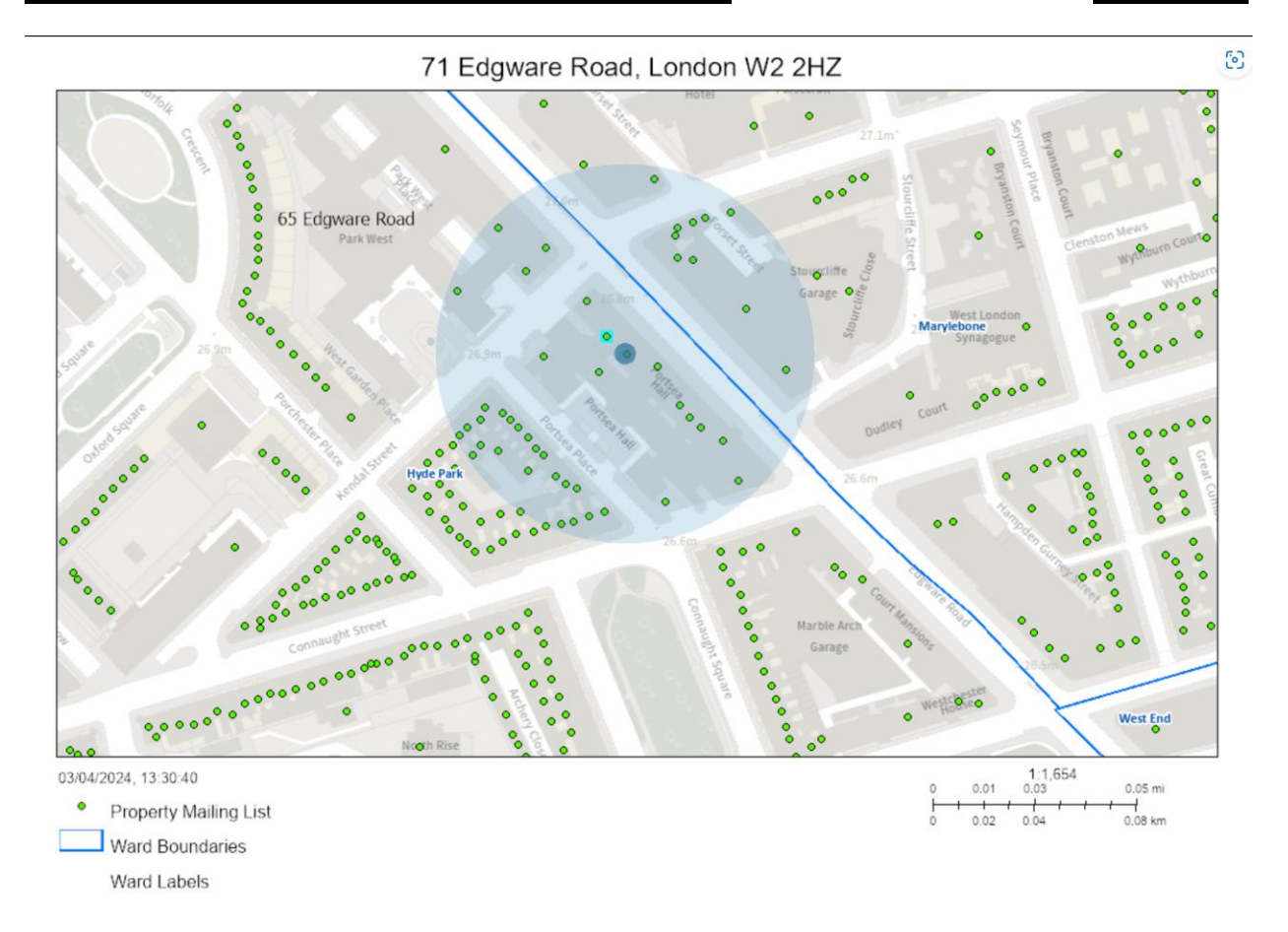
Resident Count: 829